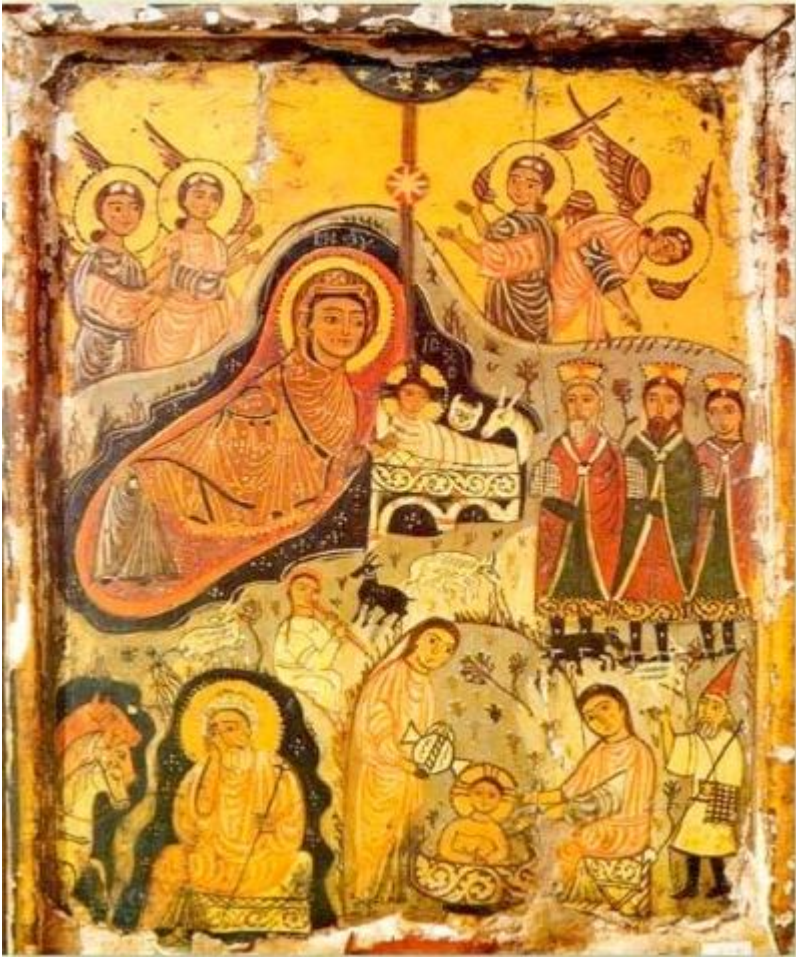
Icon of Nativity from Mt. Sinai