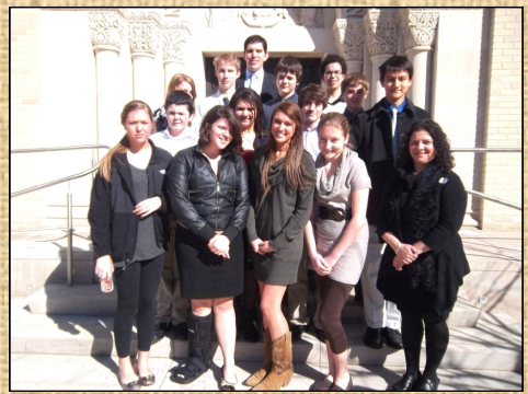
GOYA in Birmingham Jan 27-29 @ Holy Trinity-Holy Cross Cathedral